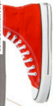
ECO CONVERSE £45 ETHLETIC @ FASHION- CONSCIENCE.COM