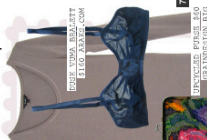
DUSK VUMA BRALETT $160 ARAKS.COM