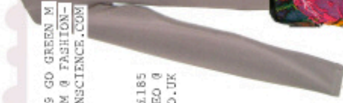
DRESS £29 GO GREEN M BY M @ FASHION- CONSCIENCE.COM