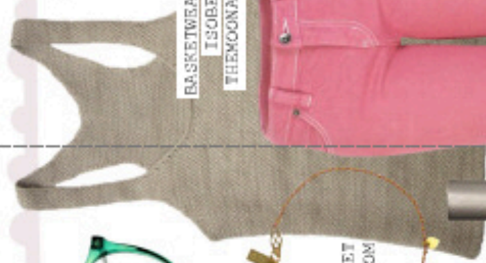
BASKETWEAVE TANK £185 ISOBEL AND CLEO @ THEMOONANDMARS.CO.UK