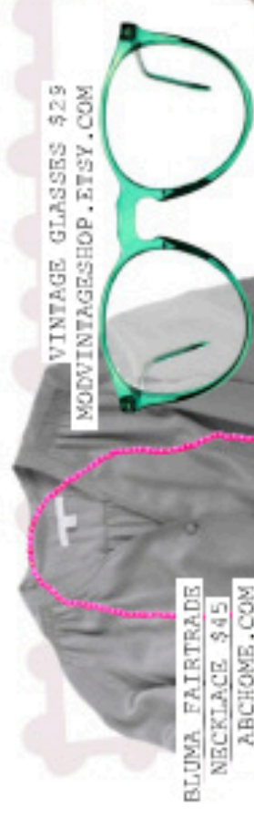
VINTAGE GLASSES $29 MODVINTAGESHOP.ETSY.COM