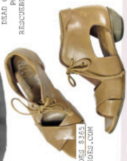
ARGILA SHOES $365 HABITATSHOES.COM