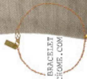
HEART BRACELET $115 ABCHOME.COM