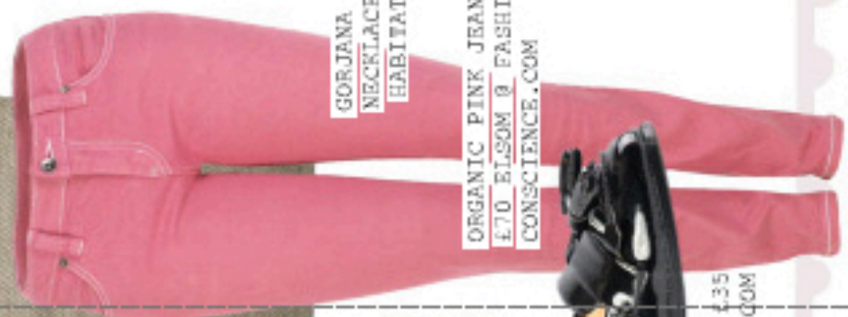
ORGANIC PINK JEANS £70 ELISOM @ FASHION- CONSCIENCE.COM