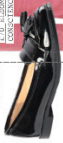
AUDREY LOAFERS $35 KATEKANZIER.COM