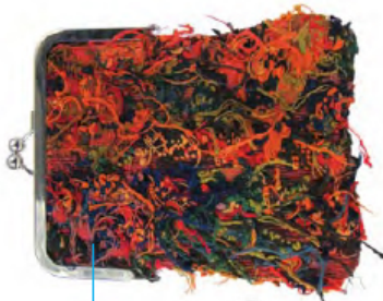
Grain 07 ID