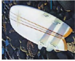
Kevin Cunningham BArch 05